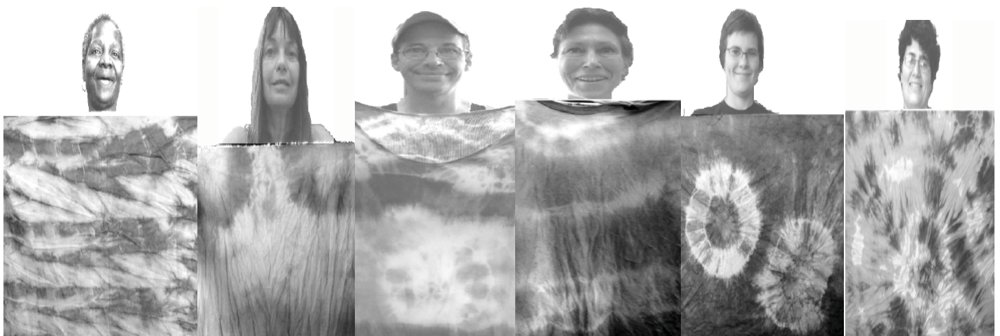
Tie-dye t-shirts created with kool-aid in the textiles class.

Dia de los Muertos / Post-Halloween Party on Sun., Nov. 2, 3:00 - 6:00 or so. Food, games & videos.