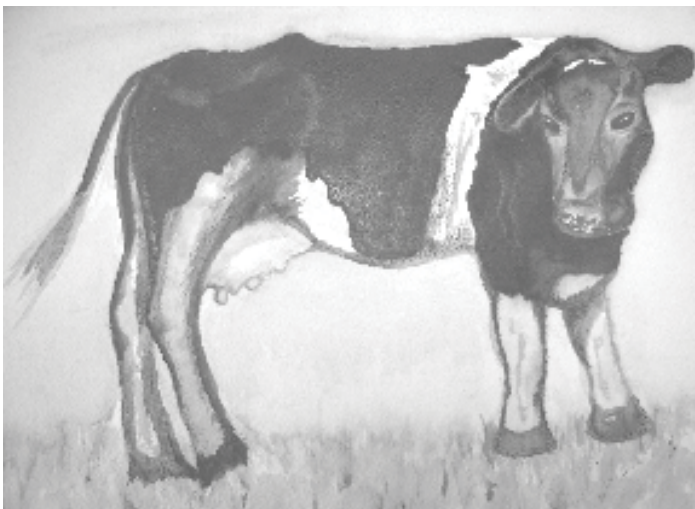
"Cow" watercolor painting by Deb Gehrke